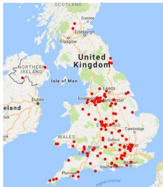
The red dots show where we have travelled to see children for our study